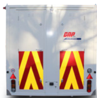
Drying Room diesel heating unit